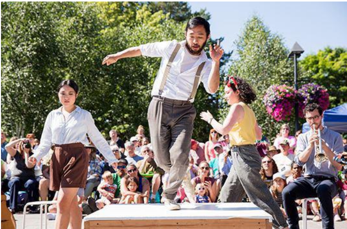
Beaverton Ten Tiny Dances 2017

Since 1999, TVC has been dedicated to finding ways to connect arts leaders and arts supporters. Over the years we’ve been part of the information movement from producing the “Westside Stories” cable show to initiating the publication for the Washington County Arts Guide, a quarterly tabloid with 50,000 copies printed per year. Through it all, TVC has continued to strengthen its bonds with municipal and statewide agencies such as the cities of Hillsboro, Beaverton, and Tigard, as well as the Regional Arts & Culture Council and Oregon Cultural Trust.