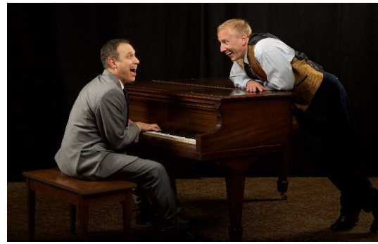
Broadway Rose Theatre, Tigard. Murder for Two

Access to information is key. TVC's website is now the region's most comprehensive source for arts and culture information. It includes an events calendar listing hundreds of local happenings and classes each month. Artists can quickly access up-to-date funding resources, arts news, and professional development opportunities.