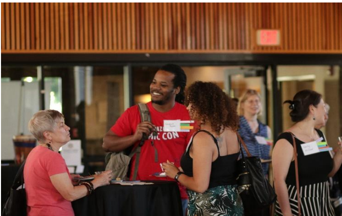
TVC Arts & Culture Leadership Incubator Launch Party, 2019

TVC’s vision is to foster the growth of a robust arts and culture ecosystem in Washington County by: 1) Increasing visibility and community engagement with local happenings; 2) Engaging under-served populations by making arts and culture more accessible; 3) Cultivating various economic opportunities in the arts and culture ecosystem; 4) Bridging resources needed to support people working in the local creative industries.