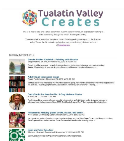
(above) Weekly Events eNewsletter (right) TVC Website homepage

In addition, TVC publishes its own original content that highlights leaders in the creative industries. This showcase of valuable and unparalleled content attracts over 39,000 website visitors per year!