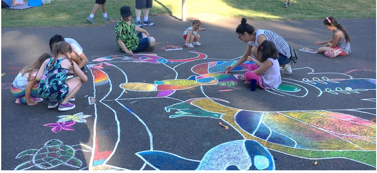
Chalk activity for Beaverton's Summer Picnic, 2019.

La Strada dei Pastelli Chalk Art Festival is an annual signature event! It's a community engagement distinct from all others offered in Oregon's Washington, Clackamas, or Multnomah Counties. The Festival's goal is to build visibility for Washington County's unique and diverse community assets. Modeled after similar chalk festivals throughout the United States, La Strada dei Pastelli is an immersive open-air event featuring live music, hands-on activities, food and large-scale street painting.