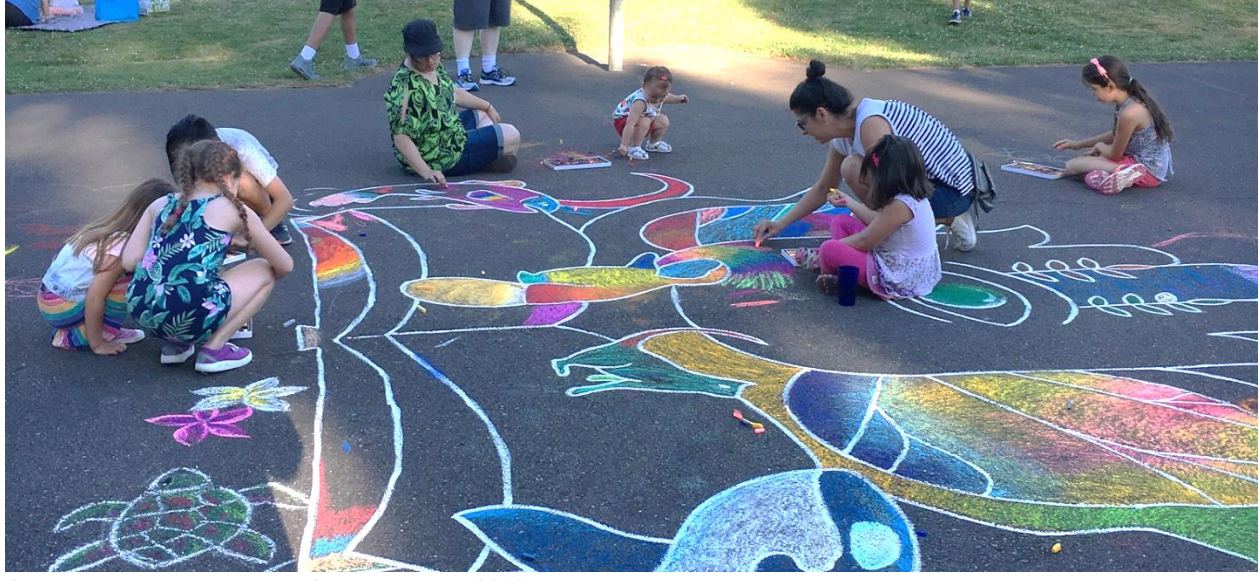
Chalk activity for Beaverton's Summer Picnic, 2019.

La Strada dei Pastelli Chalk Art Festival is an annual signature event! It's a community engagement distinct from all others offered in Oregon's Washington, Clackamas, or Multnomah Counties. The Festival's goal is to build visibility for Washington County's unique and diverse community assets. Modeled after similar chalk festivals throughout the United States, La Strada dei Pastelli is an immersive open-air event featuring live music, hands-on activities, food and large-scale street painting.